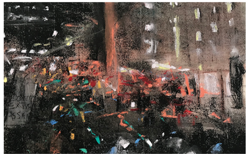
Roger Waters playing for Julian Assange outside the Home Office, London Pastel on Paper. Framed drawing.

The emails show Stratfor's web of informers, pay-off structure, payment laundering techniques and psychological methods. Read full press release here.