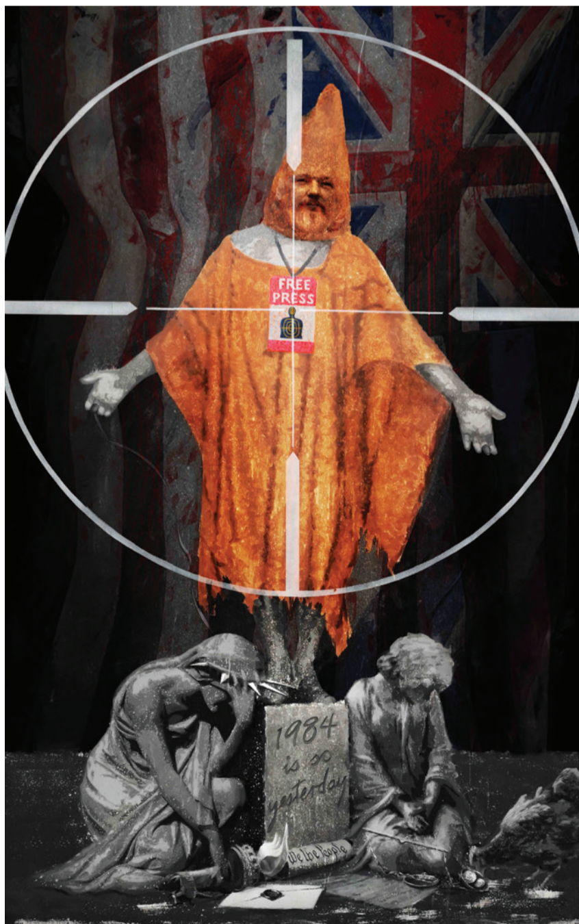
“Persecution” by Norwegian street artist AFK

In the summer of 2015, when Continued on page 12