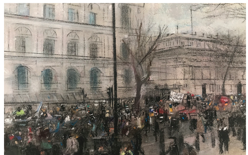
March for Julian Assange, Whitehall Unframed drawing sent to Julian Assange at Belmarsh, so he could see the crowds of people fighting for him. Pastel on Paper.